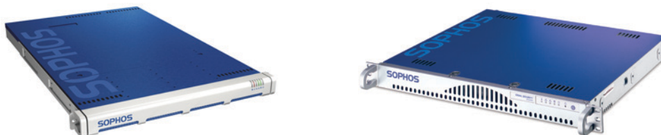
ES5000 (ES8000 is identical) and ES1100: fully integrated email gateway protection from Sophos